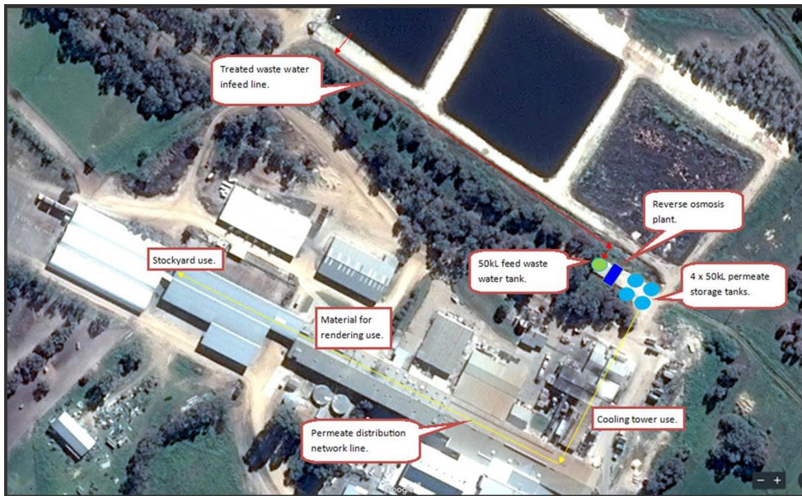
Site plan showing existing structures and proposed shed, tanks and reverse osmosis system.