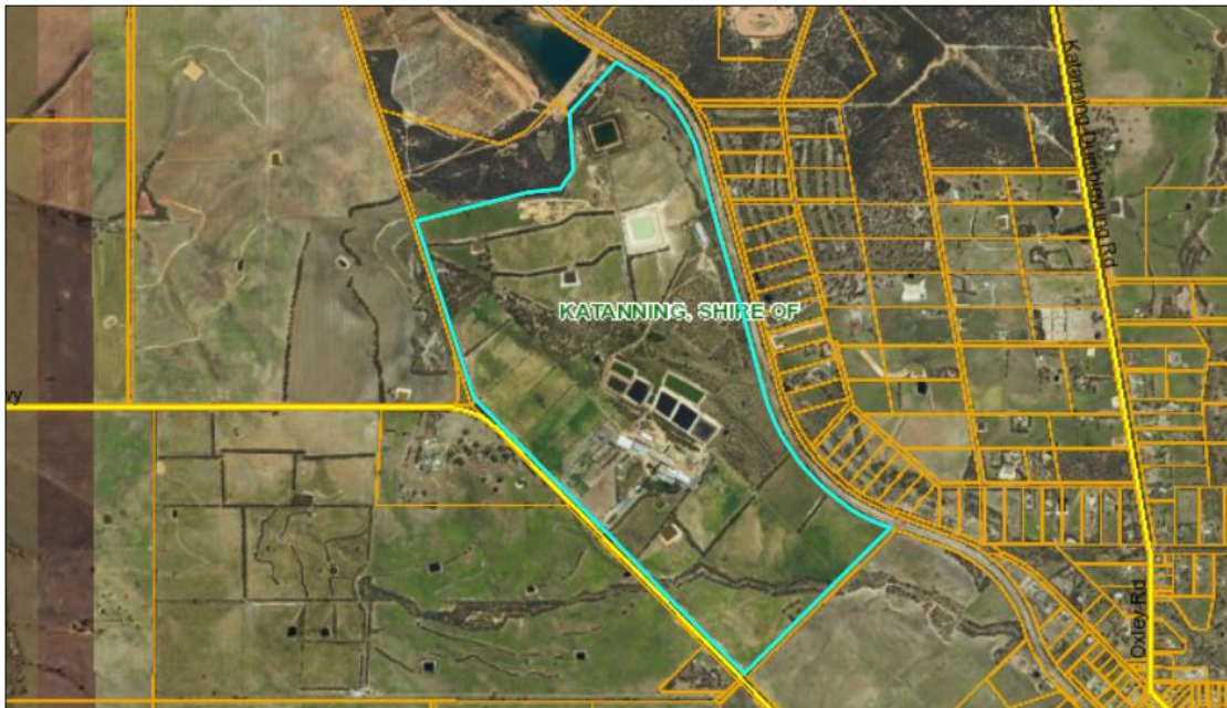
Aerial image of Lot 3 (28013) Great Southern Highway

Following preliminary enquires in March, a Development Application was received for the installation of a shed, tanks and 'Reverse Osmosis' system at the Abattoir. The plans show a 6m long 2.5m wide 2.87m high steel frame metal clad shed, five (5) 50kl round poly water tanks and the plant to enable re-use of wastewater. The proposed structures will be located north east of the existing Abattoir buildings, adjacent to the storage dams.