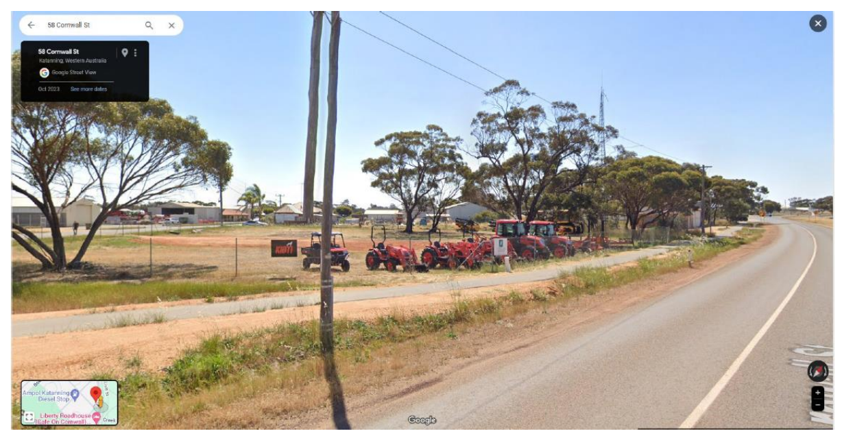
Image of Existing Unauthorised Development

The subject land has historically been cleared and developed for open storage purposes and does not contain any built form improvements aside from ring lock-style boundary fencing. There are several existing trees on the property of varying size, none of which are of regional environmental significance. It is noted the current landowner has constructed a new crossover along the land's Beaufort Street frontage as well as an associated internal driveway access and allowed the applicant to park and display agricultural machinery on the property and install advertising signage on the boundary fencing along Cornwall Street, none of which has been formally approved by the Shire but will be formalised if the application the subject of this report is approved. Notwithstanding this fact, all recent development on the land is unauthorised which is a matter that could be pursued by the Shire if Council forms the view there is a need to do so.