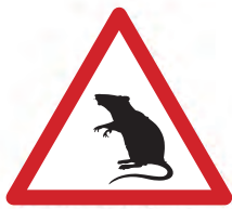
Mice & Rodents