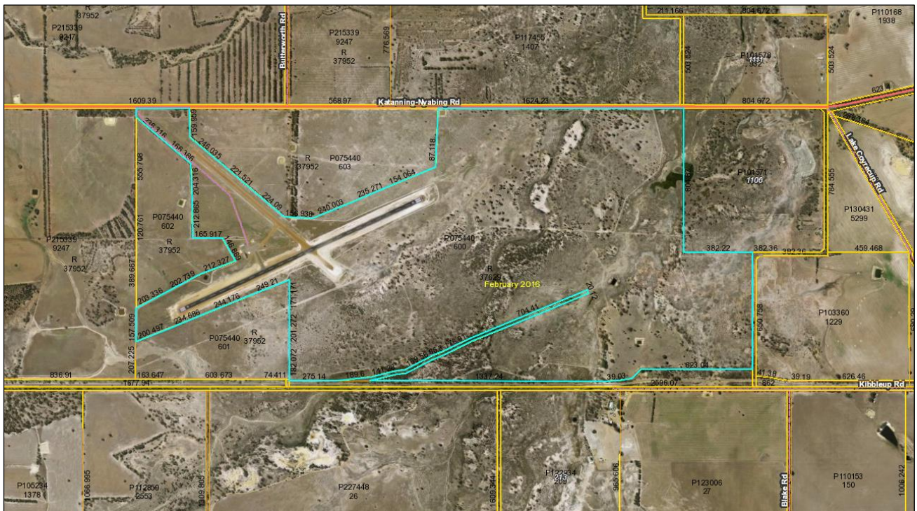
Aerial view of Subject Land Reserve 37629

Reserve 37629 is Lot 600 on DP 75440 Volume LR3163/Folio526.