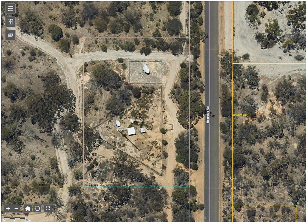
Aerial view of Subject Land Reserve 37809

The subject land contains Towers and Communication Infrastructure.