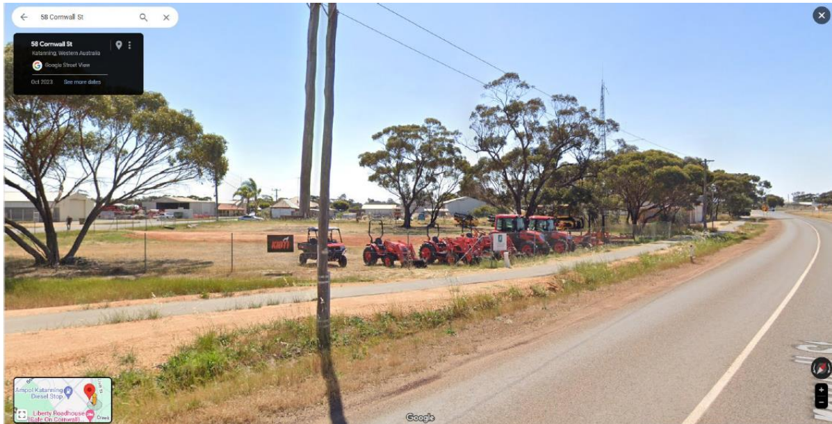
Image of Existing Unauthorised Development

advertising signage on the boundary fencing along Cornwall Street, none of which has been formally approved by the Shire but will be formalised if the application the subject of this report is approved. Notwithstanding this fact, all recent development on the land is unauthorised which is a matter that could be pursued by the Shire if Council forms the view there is a need to do so.