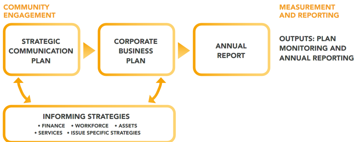
Integrated Planning and Reporting Process

Workforce planning is undertaken to ensure that the Shire workforce is able to deliver Council's current and future objectives. The Workforce Plan is a strategic informing document that addresses the requirements of the integrated planning and reporting framework outlined in the Local Government Act 1995.