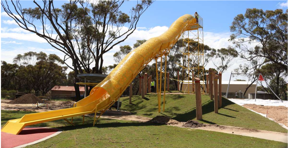
The refurbished double bump slide at the All Ages Playground