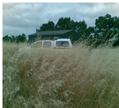
Non – compliance